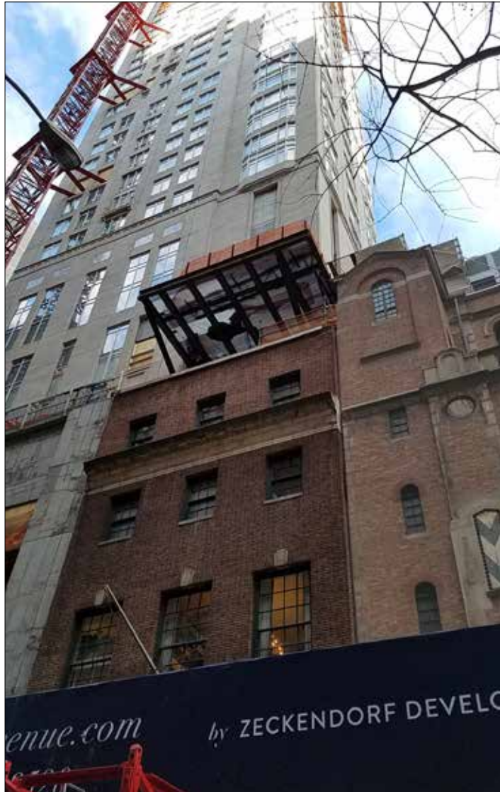
The Grolier Club (the darker brown building with three windows per floor) is now wrapped by a new building (still under construction) to which it sold its air rights for what was reported to be about $7 million.