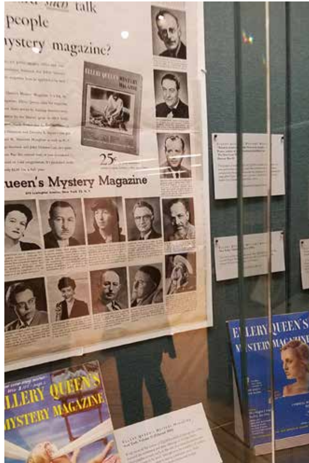
On display at Columbia University Library January 24 were items from their recent Ellery Queen show and their new Harper's Publisher show.

The dates of Bibliography Week are dictated by the bylaws of the Grolier club; their annual meeting falls on the fourth Thursday in January. Other organizations in turn set their gatherings around this date, and since there is significant overlap among the membership of these groups, it is quite convenient for those who are able to attend. Though the Grolier Club releases the only official list of Bibliography Week events, many of those listed have entirely different organizers and sponsors.