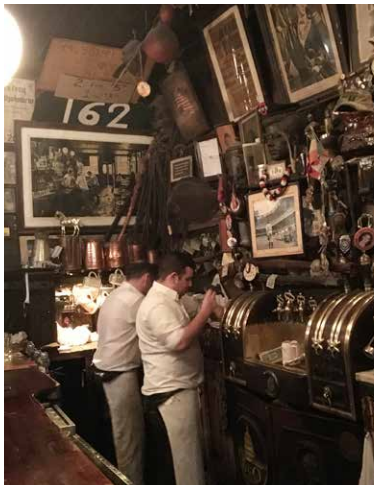
McSorley's, one of two claimed-to-be-oldest bars in the city.