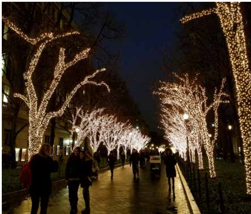
Winter lights welcome at Columbia University.

culture of the city. To this list I should add Westsider Books, the Argosy Book Store, and Carnegie Hill Books. Zine lovers will find a haven on Metropolitan Avenue in Williamsburg, Brooklyn, where comic book seller Desert Island and alternative print mecca Quimby's (their first location is still going strong in Chicago's Wicker Park) stand next door to each other.